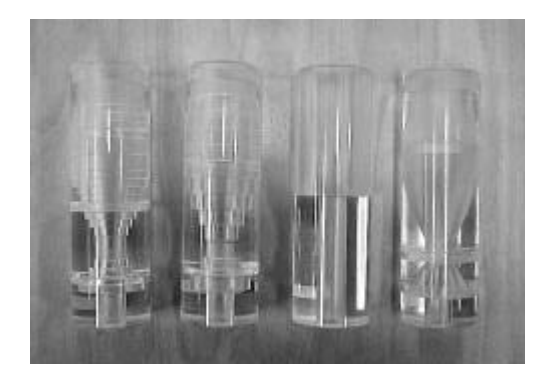
Fig. 1.- Four Cylinder Models

There are two types of mechanical models of human vocal tract of Japanese vowel /a/ designed by Arai (2001) [1]. One is several acrylic plates, the other is hollowed out cylinder. For the cylinder type, we newly made four models that were different in step sizes of step-wise approximation of Arai's model. The step-sizes are 80 mm (C80), 10 mm (C10), 5 mm (C5), and polygonal line approximation (CL). The length of all vocal tracts was 160 mm each.