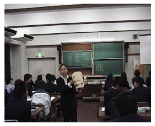
Fig. 3 Lecture with the wooden sculpture

Finally, we used the plate and cylinder models we developed to explained why the cavity and source sound are important for vowel production. First we explained how the models work, and why we made the two types of models. Then we produced speech with the models. After this lecture, we divided the students up into 5 groups for a hands-on experiment. Each group examined one of the 5 Japanese vowels. The students lined up the plates based on the table of the diameters given in the handout. We gave 20 plates to each group. This left the groups with some extra plates, as, for example, /a/ only needs 14 to 17 plates. Lining up the plates was simple for the twelfth-grade students, and they finished quickly. We then went around to each group and attached a sound source to the model to produce vowel sounds. We answered the students' questions during this time. Also during this small-group work, we changed the position of plates so the students could see how point of constriction affects vowel quality. At the end of the class we gave the students a questionnaire regarding the lecture.