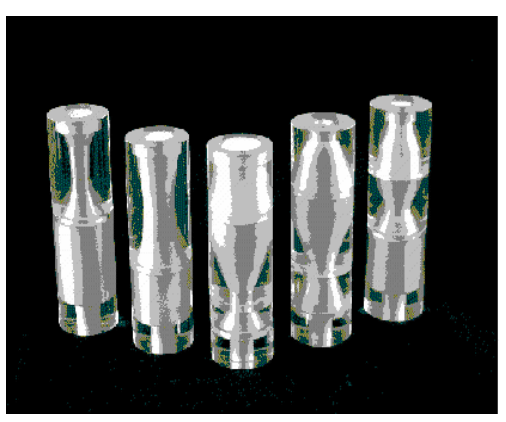
Fig. 2 Cylindrical models

In a previous study, we made four cylindrical models of the Japanese vowel /a/, which differed only in step size approximations [3]. The cylinder models had external diameters of 50mm and were 160mm long. The simulations of these four cylindrical models showed that the step sizes did not influence the formants of the outputs in a significant way. We also compared the characteristics of the plate and cylindrical type models with the same configurations [7]. Finally, we developed a model for a nasalised vowel [3].